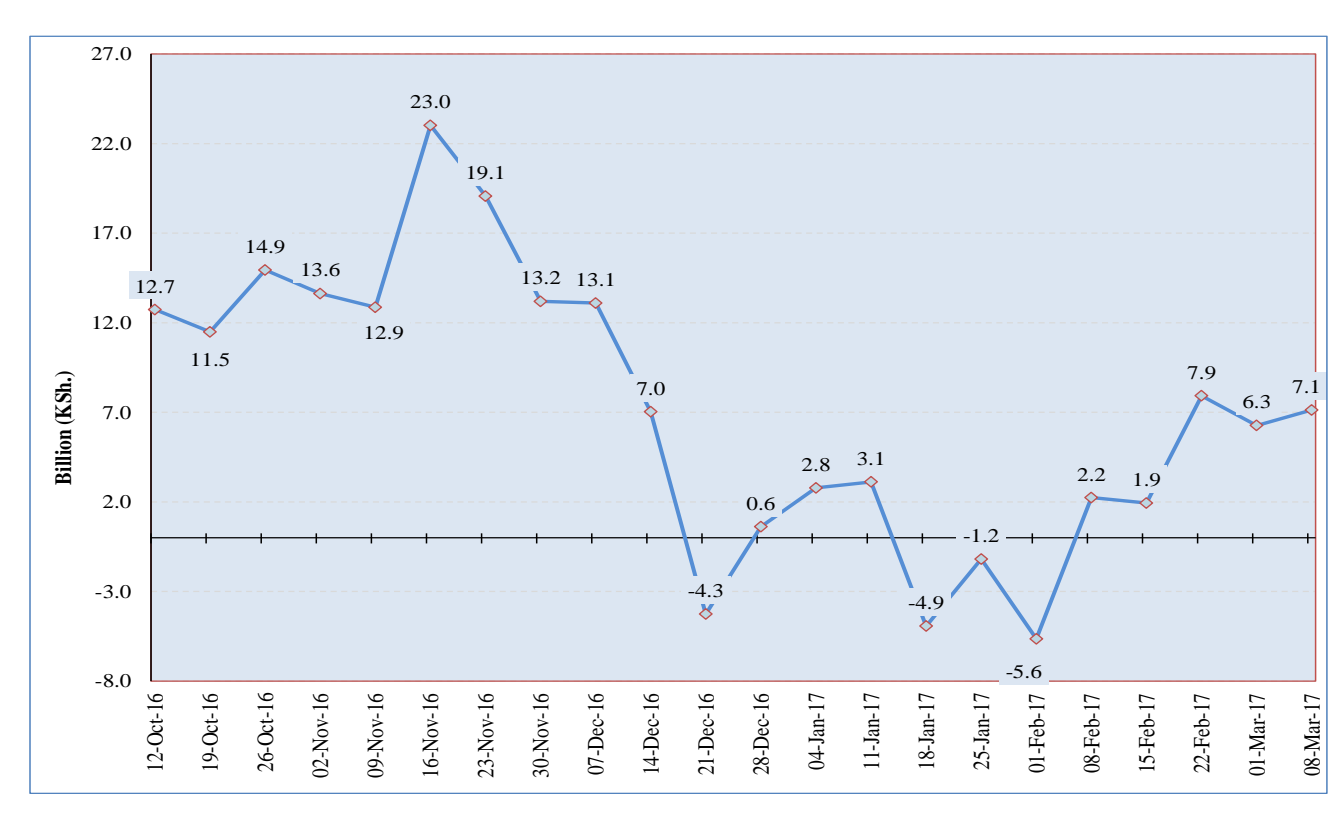
CHART A: COMMERCIAL BANKS EXCESS RESERVES